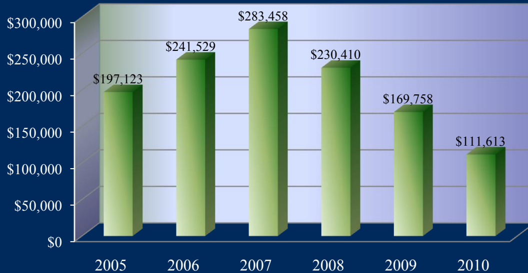
Graffiti Dollars - 6 Year Snapshot