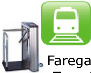
Faregates / Turnstiles