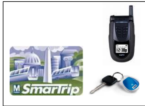
Contactless Fare Media (CSC / NFC)