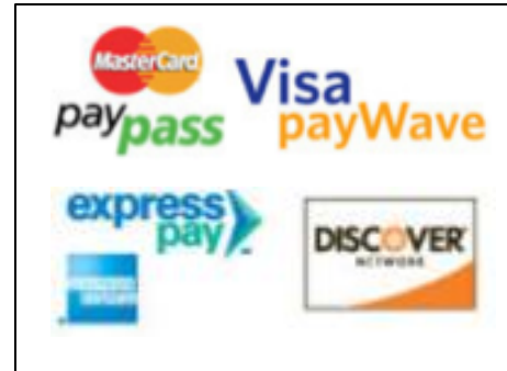
Open Loop Cards