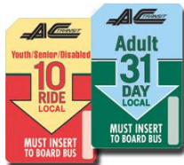
Magnetic / Paper Fare Media