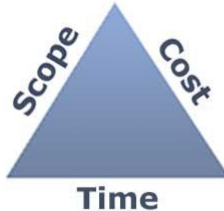
The Iron Triangle

The purpose of project management is easily defined: