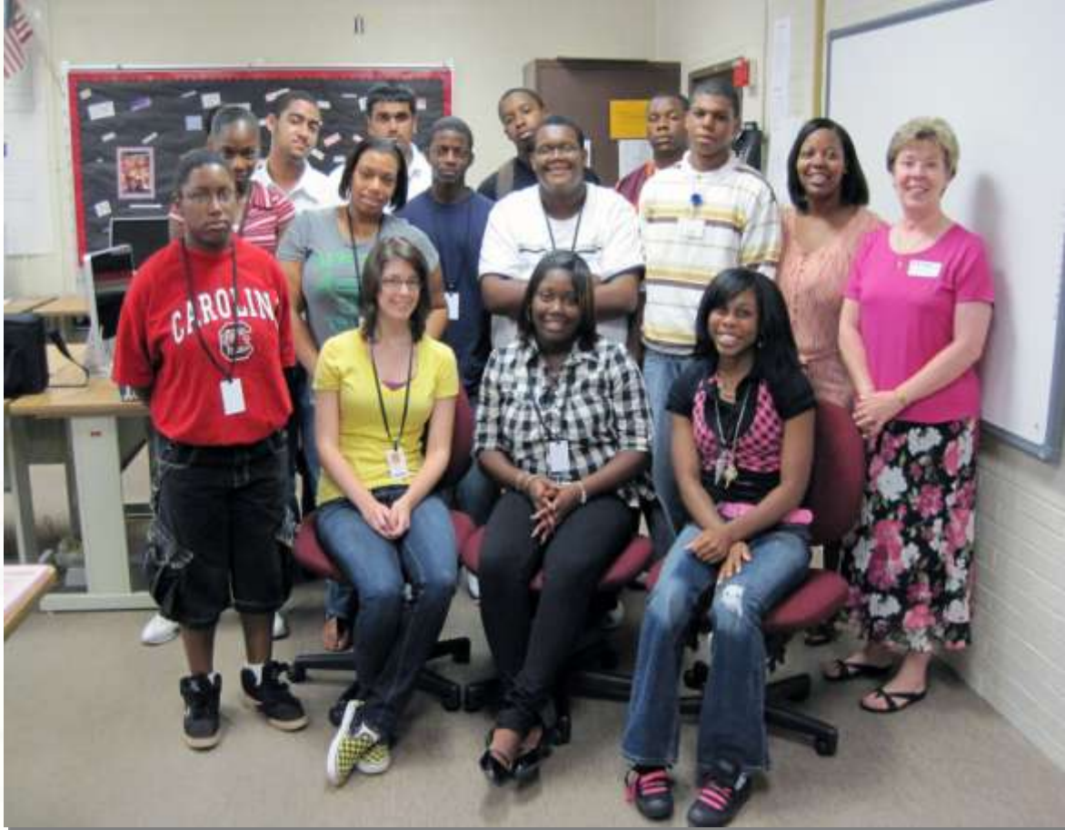
Orangeburg District 5 Technology Center