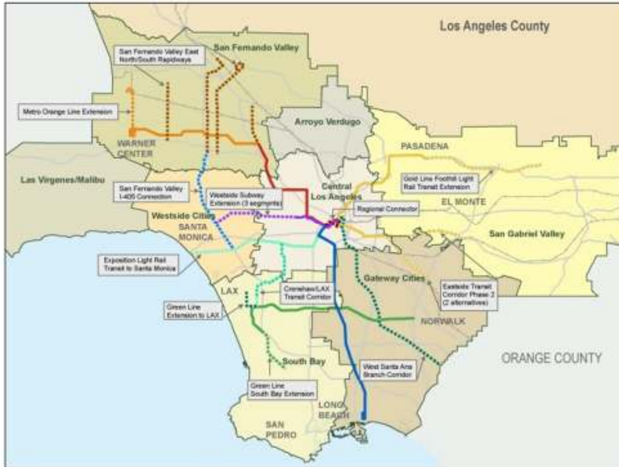
30/10 Initiative - Transit Corridors