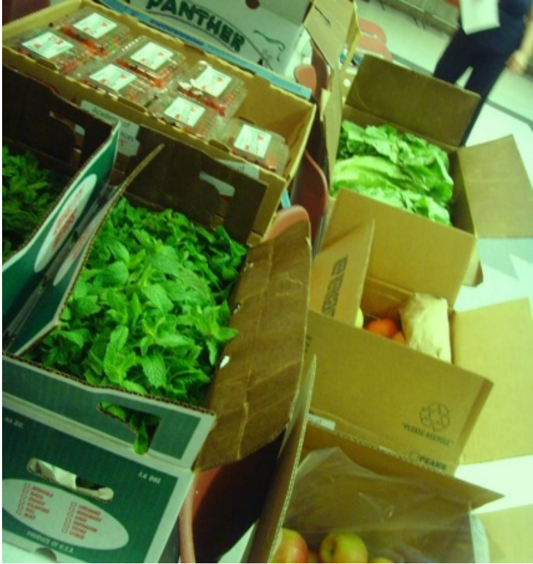
SEPTA EMPLOYEE CSA PROGRAM

Key Performance Indicator Target // Three New Farmers Markets on SEPTA Property