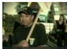
Video: "Out of The Shadows" January 11, 2013