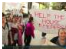
Long Beach Living Wage Campaign January 7, 2013