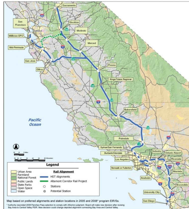
California High-Speed Train Map, Statewide Overview