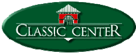
Exhibit Installation & Dismantling

Name of Event / Show: _____ Booth #: _____ Date: _____ Firm Name: _____ Contact: _____ Firm Address: _____ Phone: _____ Fax: _____ City: _____ State: _____ Zip: _____ Alt Contact: _____