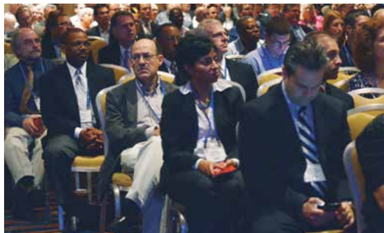
More than 1,400 people attended the Rail Conference.

Retiring U.S. Transportation Secretary Ray LaHood spoke to an enthusiastic, standing-room only crowd of nearly 700, urging members to "march up [to Capitol Hill] and talk about what public transit really does – it serves your friends and neighbors." Former Rep. Steve LaTourette (R-OH) spoke at a session sponsored by APTA business members. Many attendees took time to