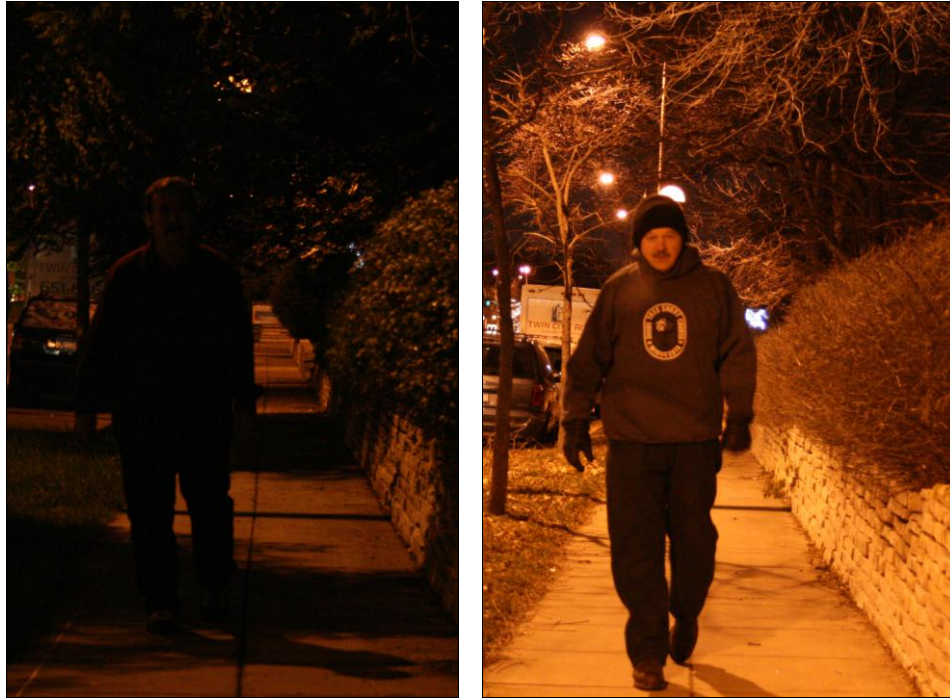
FIGURE 4 Impact of Vegetation on Lighting Systems

shadows. Designs that include decorative landscaping at transit facilities should be planned with the full understanding of density, height and breadth of the landscape as it grows to full maturity.