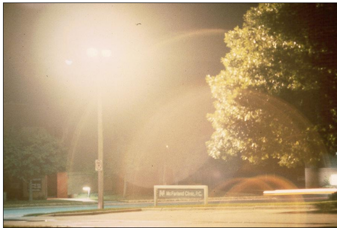
FIGURE 3 Impact of Glare on Visibility