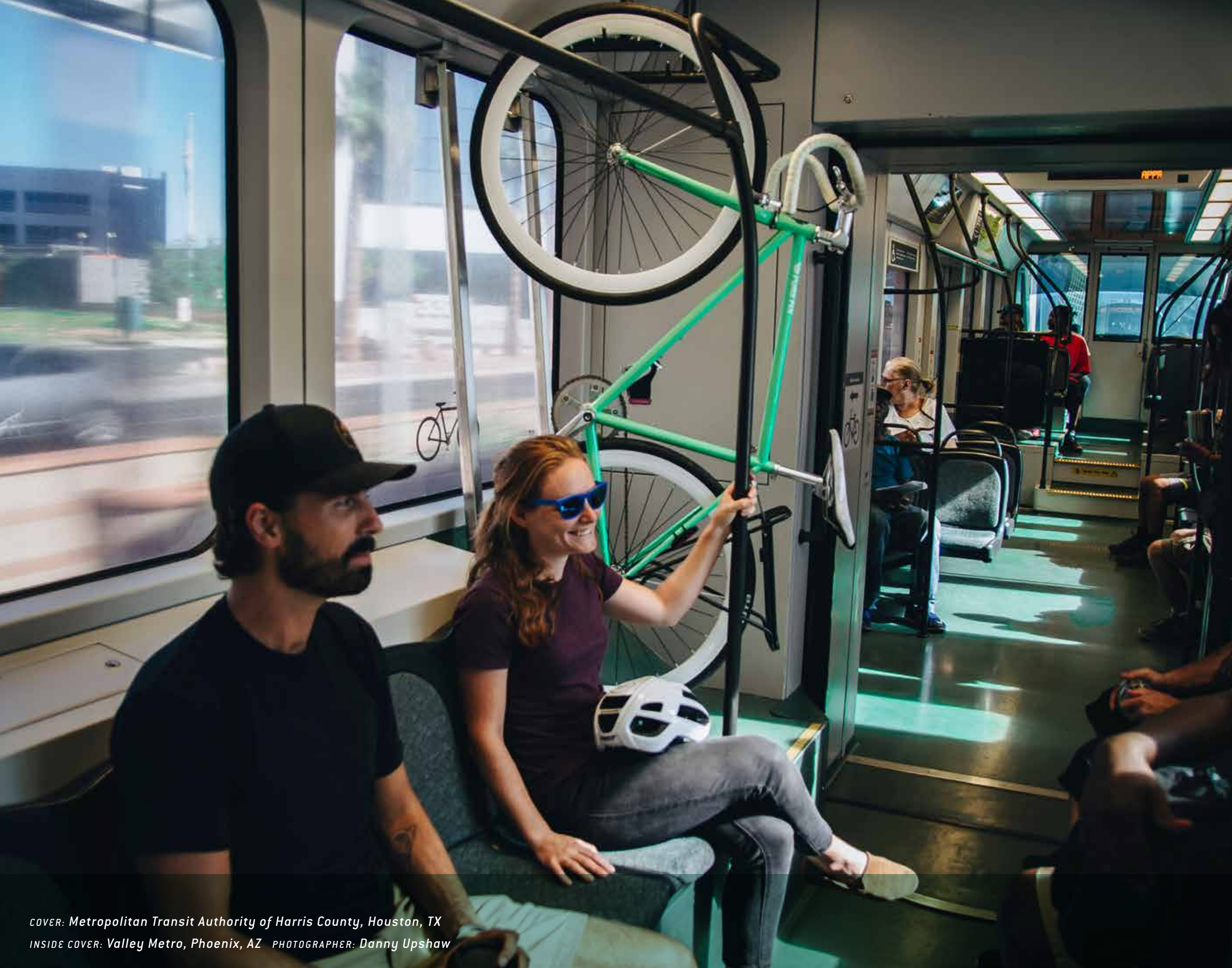
COVER: Metropolitan Transit Authority of Harris County, Houston, TX INSIDE COVER: Valley Metro, Phoenix, AZ