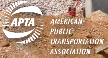
Trinity Metro, Fort Worth, TX