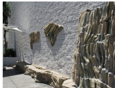
“Channels” by Julia Klembeck

Near a high-frequented transit area close to Cal State Long Beach, “Channels” is an immersive sculptural installation that also acts as seating for customers.