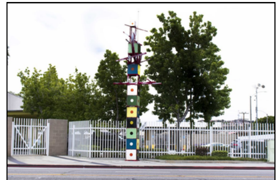
“Naughtical But Nice” by Peter Shire

LBT’s yard for Battery-electric and hybrid buses at 1963 E. Anaheim St., which features art around the property grounds. There are multiple bus stops for nearby routes that also feature additional public art on Anaheim St. and Cherry Ave., including the featured “Naughtical But Nice.”