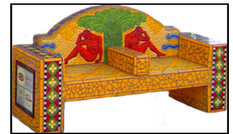
“Passing Time” by Kerry Zarders

Located at a bus stop at First St. and Linden Ave, “Passing Time” is an intricate mosaic tile-work lines the