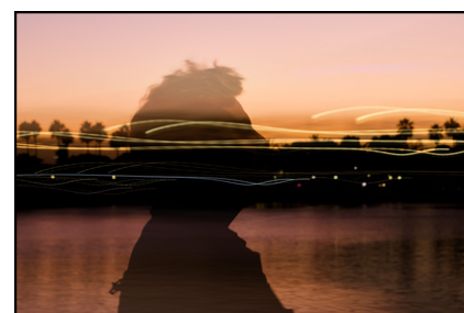
"Serene Walk Along the Waterfront" by Michael Gonzales, Unfiltered Photo Contest

Currently on display, the winning work from the Unfiltered Photo Contest capture moments of community, culture, and creativity across six unique categories.