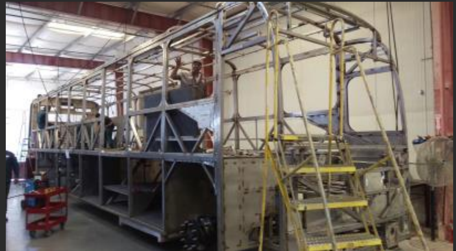
Frame Welded on Chassis in Jig