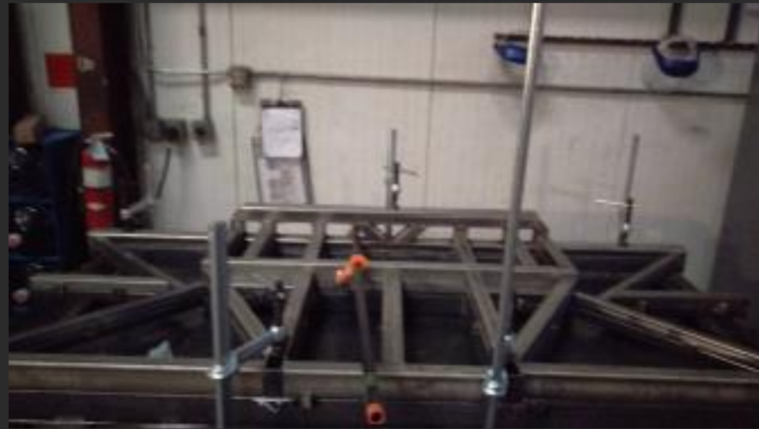
Chassis Section in Jig