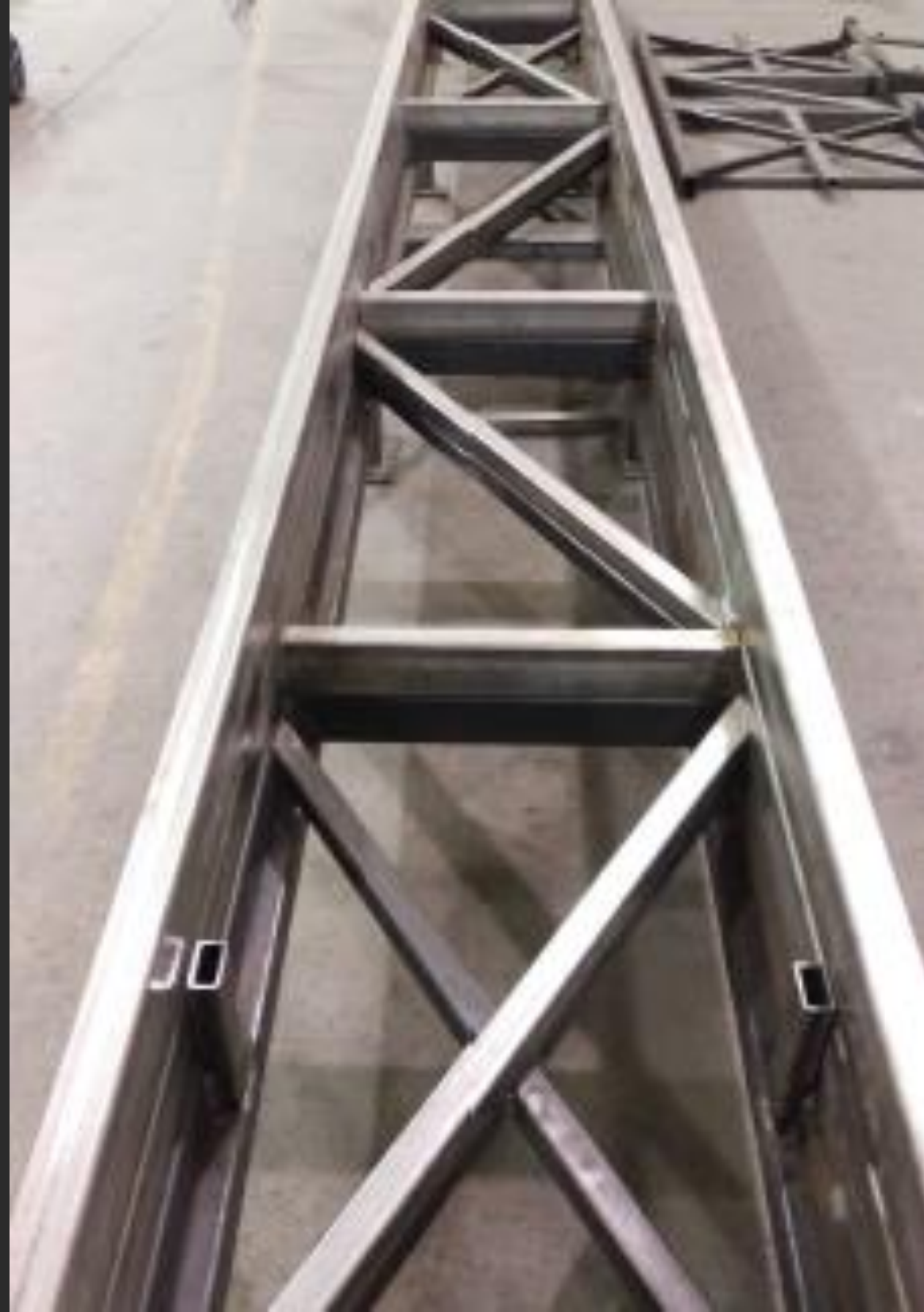
Chassis Backbone Frame