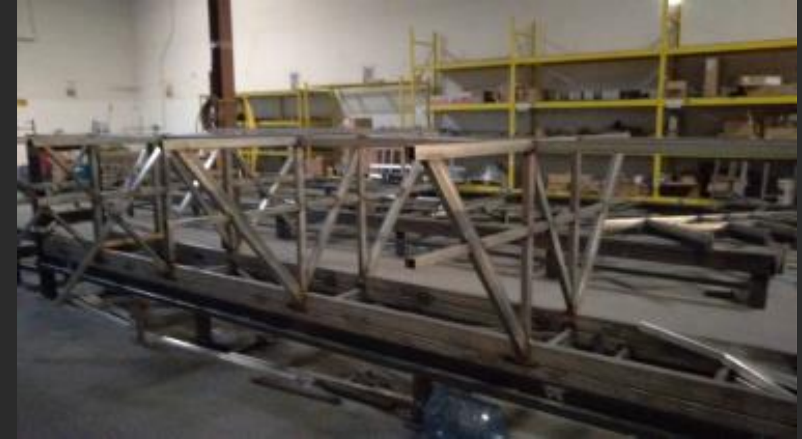
Chassis Sections on Backbone