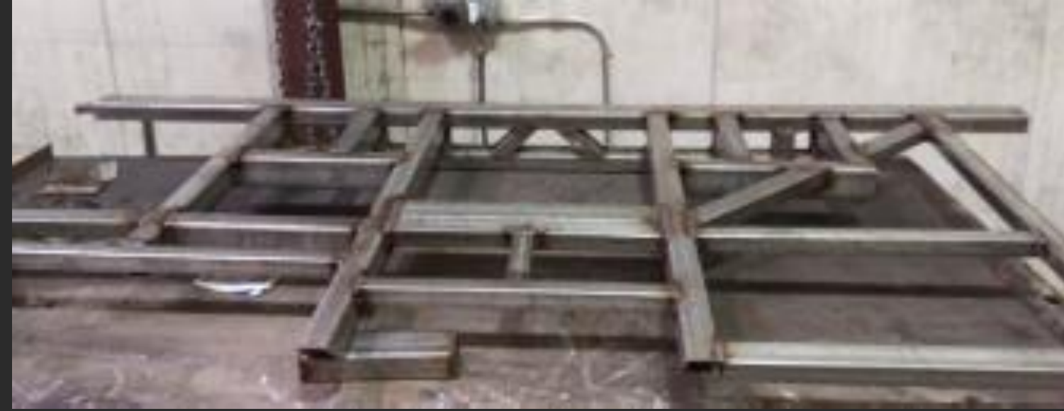
Section of Chassis