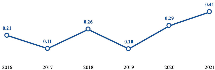
Figure 1: Transit Worker Fatality Rate (per 100M VRM)