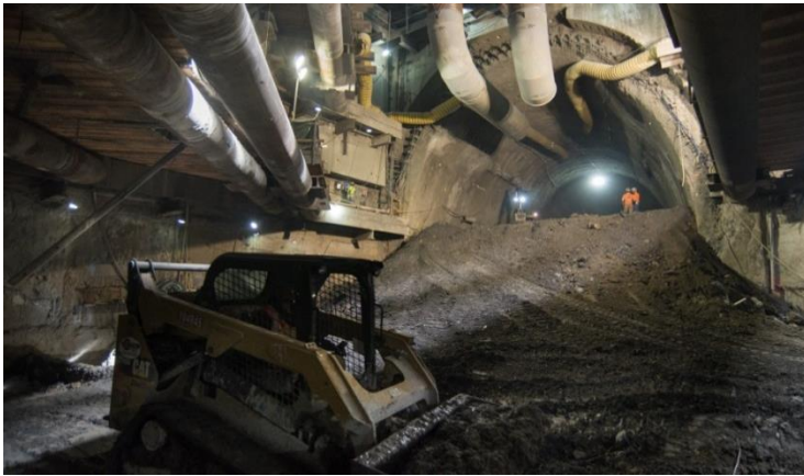
Chinatown Station Construction