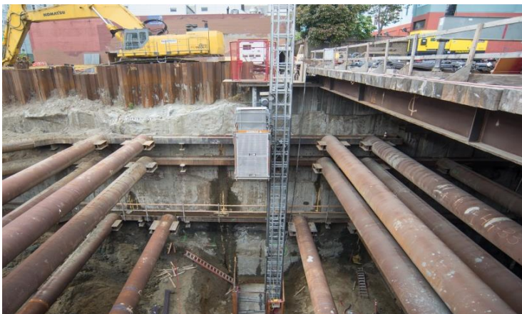
Moscone Station Construction