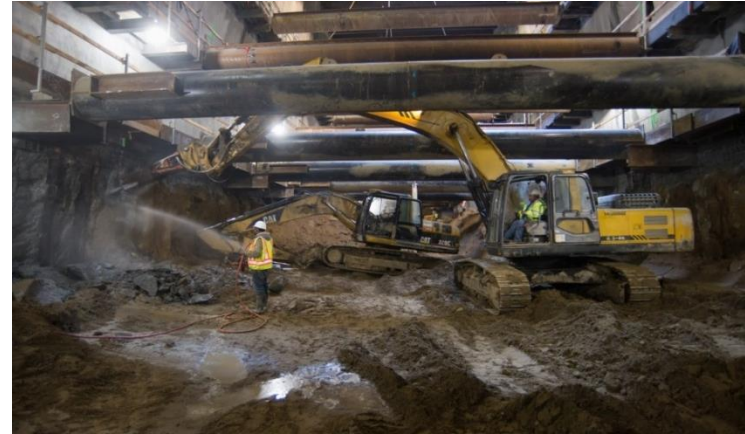
Union Square Station Construction