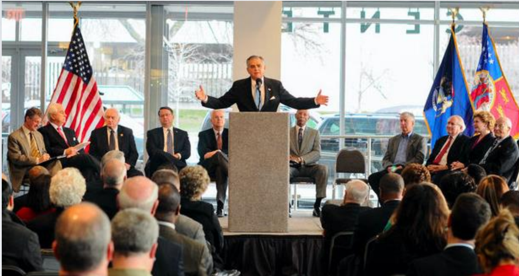
Former United States Secretary of Transportation Ray LaHood announces streetcar funding