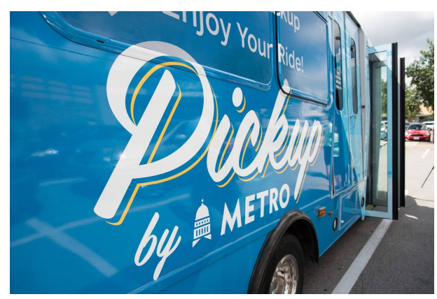
Cap Metro, the city transit agency in Austin, Texas, has begun offering rides on demand via Pickup smartphone app.

With on-demand transportation services growing, cities need to adapt. Some are doing just that.