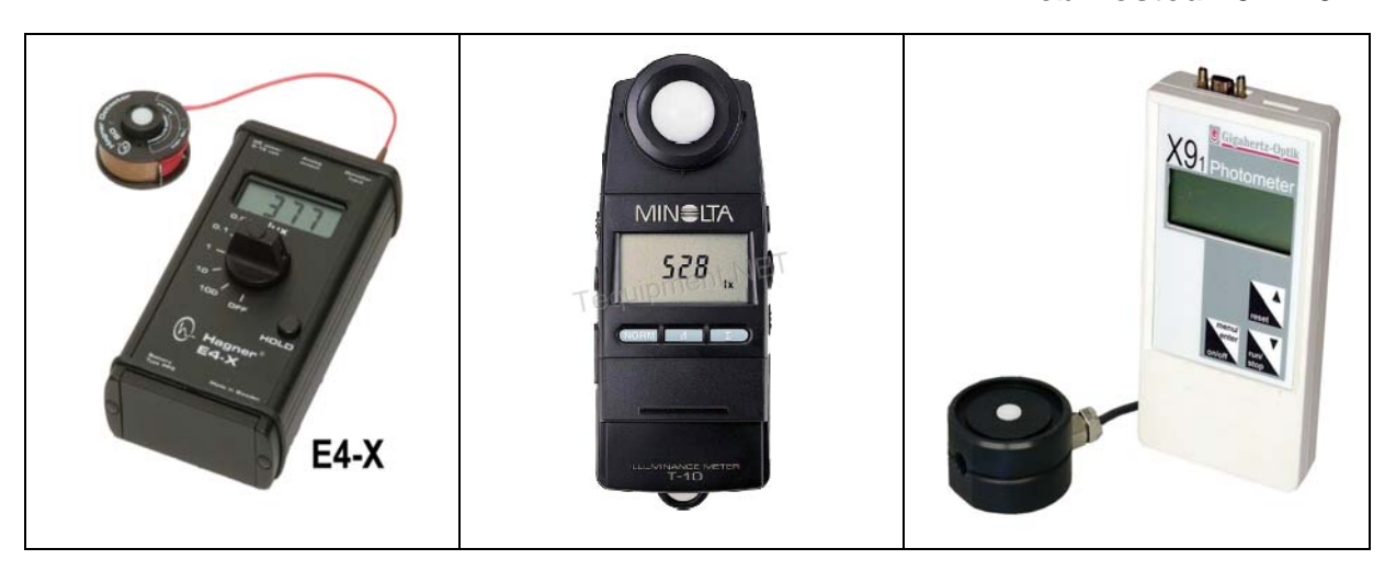
Figure C1. Typical meters for illuminance measurements