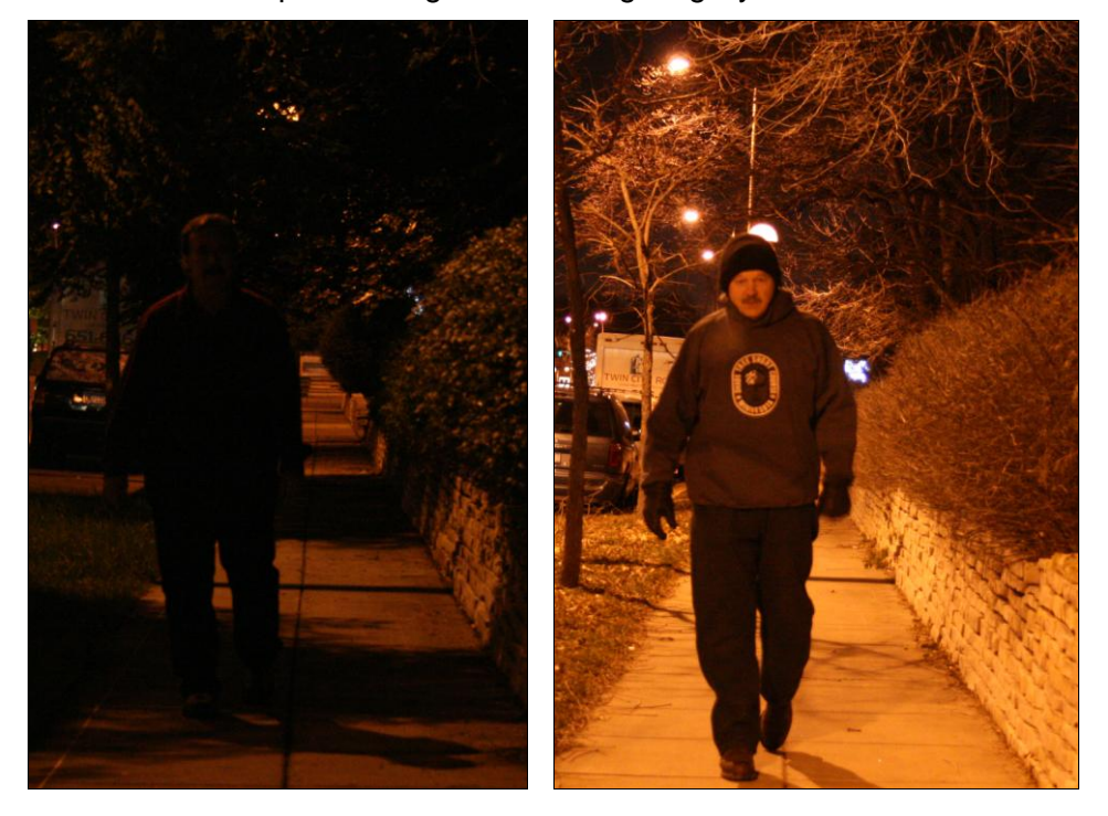
FIGURE 4 Impact of Vegetation on Lighting Systems

shadows. Designs that include decorative landscaping at transit facilities should be planned with the full understanding of density, height and breadth of the landscape as it grows to full maturity.