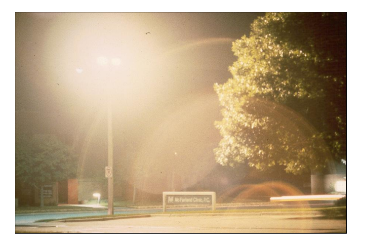
FIGURE 3 Impact of Glare on Visibility