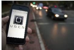
RTD Go! UBER