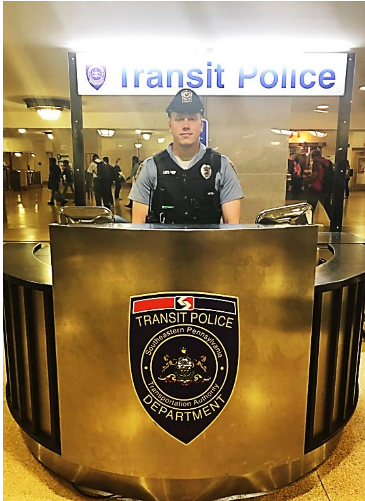
New Transit Police Kiosk in Suburban Station