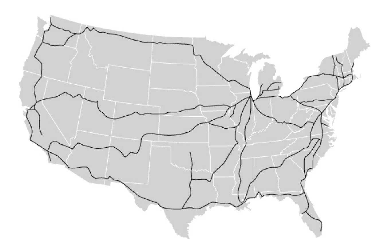
Map 1: AMTRAK Routes in 2007

Two maps offer an idea of what rail service might be like under the Act, each representing one end of a scale. The first is a map of Amtrak's current trains: