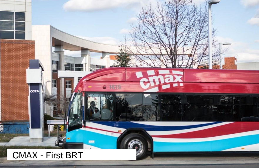
CMAX - First BRT