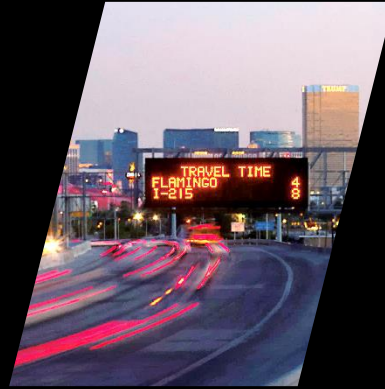
Traffic Management Systems