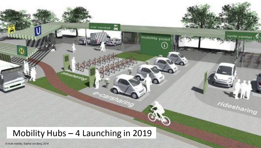
Mobility Hubs – 4 Launching in 2019