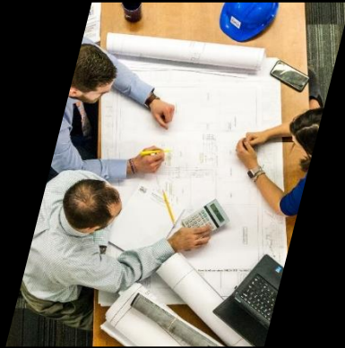
Roadway Planning & Funding