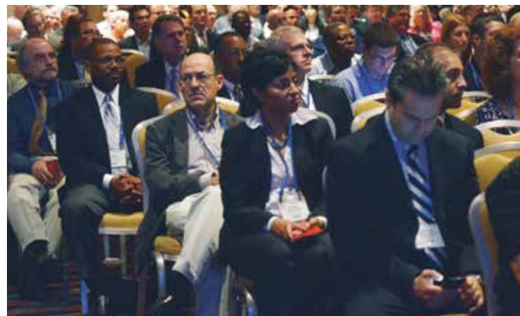
More than 1,400 people attended the Rail Conference.

Retiring U.S. Transportation Secretary Ray LaHood spoke to an enthusiastic, standing-room only crowd of nearly 700, urging members to "march up [to Capitol Hill] and talk about what public transit really does – it serves your friends and neighbors." Former Rep. Steve LaTourette (R-OH) spoke at a session sponsored by APTA business members. Many attendees took time to