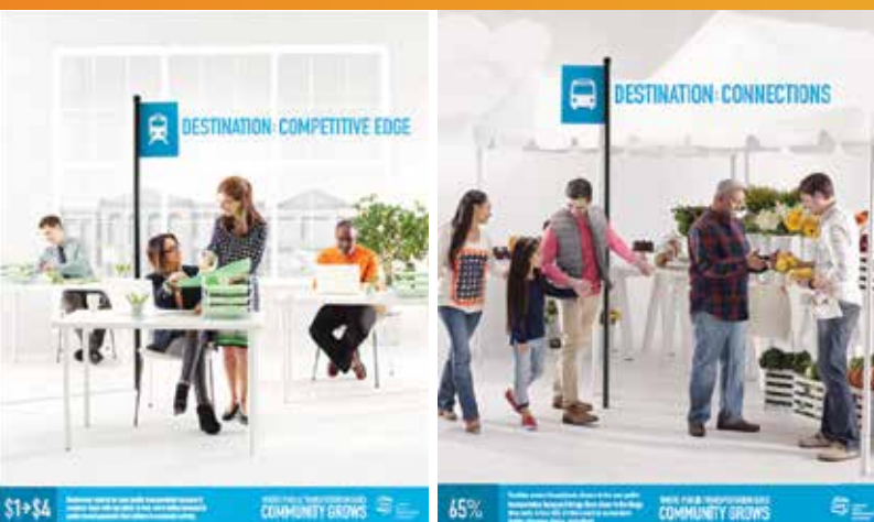
"Voices for Public Transit" harnessed the power of public transit.