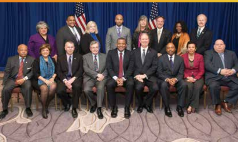
APTA’s Executive Committee met with DOT Secretary Anthony Foxx at APTA’s 2014 Legislative Conference.

APTA members attended listening sessions, provided input, and helped shape APTA’s next five-year strategic plan.